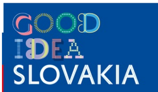
3. The River Danube bisects the city, 4. Slovakia's new branding campaign.