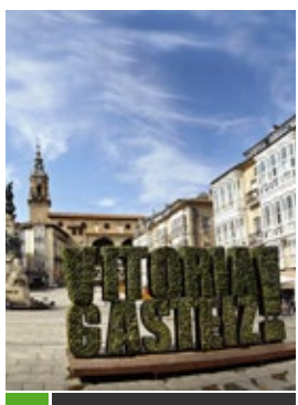
TOURISM Green and gracious